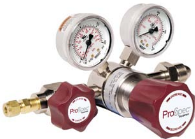
3003 Series – Oxygen Regulators (see page E•270)